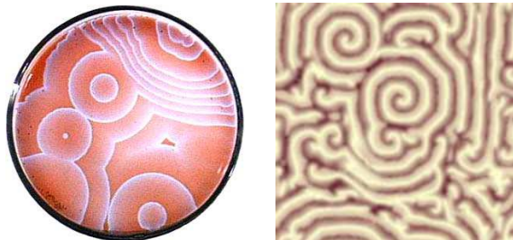
Figure: To the left we see a picture of a chemical reaction (Belousov-Zhabotinsky) in progress, and to the right a mathematical model of the reaction mimicking the complex time evolution of the pattern.

A powerful tool in mathematics (and other sciences, and life itself) is to discover and make use of patterns ( c.f. Math 596 “Pattern Formation.”)